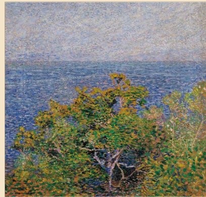
Alberi sul mare, 1891