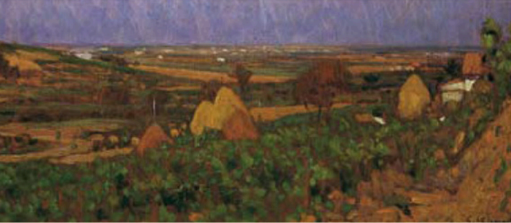
Motivo toscano, 1928