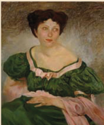
L'abito verde, 1903

Over the years, Kienerk's brushstrokes be-