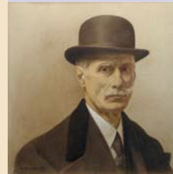
Autoritratto col cappello, 1936