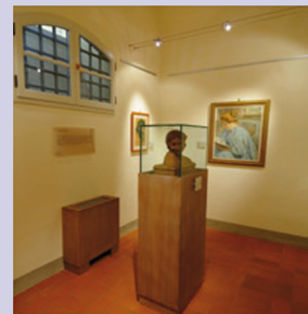
Una cella del museo

1948, in his home on Poggio alla Farnia, Fauglia.