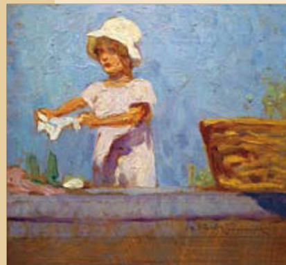
La Vittoria che lava, 1925

came more fluid and dynamic, with an effective Impressionist style, as can be observed in the painting called La lettrice (1897) (The Reader, TN). Testa Ridente, (1900) (The Laughing Head, TN), Sorriso (1900), (The Smile, TN), and Puviv de Chavannes, (about